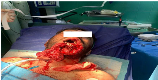
Figure 1. Maxillofacial trauma following a car accident in case 1

tracheostomy was performed immediately and uneventful. Further titrated doses of propofol up to 40 mg were required to maintain the patient sedated. After end-tidal \text{CO}_2 ( \text{ETCO}_2 ) monitoring and ensuring the secure airway, the induction of anesthesia and muscle relaxation with propofol and cisatracurium were applied. The soft tissue bleeding was repaired and the team decided to perform the secondary repair after stabilization and further radiologic assessment. Finally, muscle relaxation was reversed and the patient transferred to the ward in good general condition.